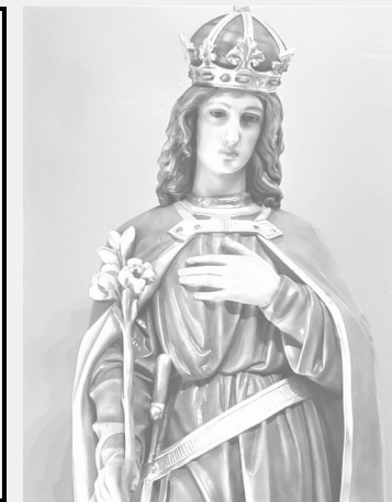
- Saint Kazimierz -

March 15th & 16th, 2025 Second Sunday in Lent