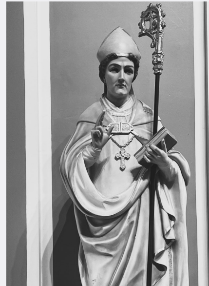
- Saint Stanislaw -

Saturday : 6:00 PM Sunday: 8:00 AM Wednesday: 6:00 PM Thursday & Friday: 8:00 AM