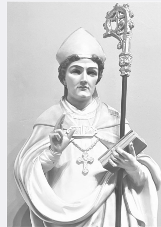
- Saint Stanislaw -

Please pray for our CCE Catechists, that they will have a spiritually fruitful Retreat on January 3rd.