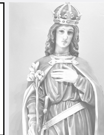
- Saint Kazimierz -

April 26th & 27th, 2025 Second Sunday of Easter