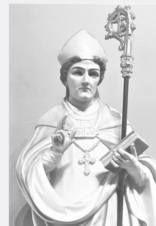
- Saint Stanislaw -

The tickets are $1.00 each and our goal is to raise enough money to purchase a new Funeral Pall. The drawing will be held on May 4 after the 8:00 AM Mass.