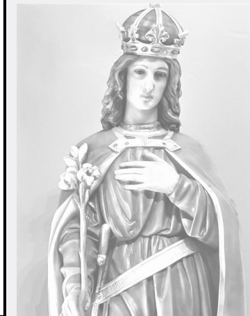
- Saint Kazimierz -

April 11th & 12th, 2026 Second Sunday of Easter Divine Mercy Sunday