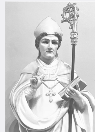
- Saint Stanislaw -