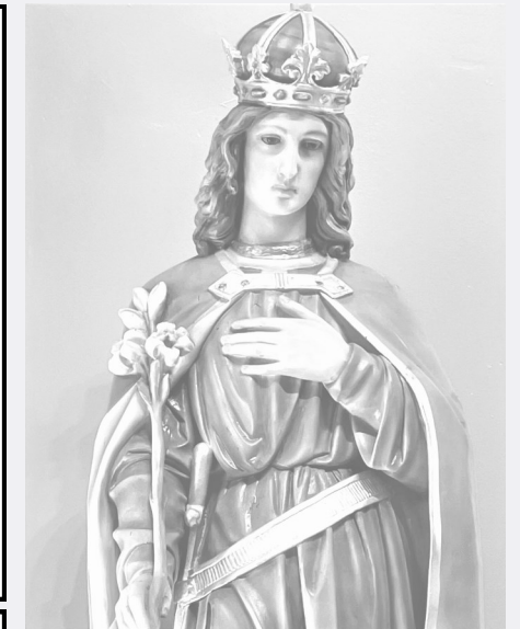
- Saint Kazimierz -