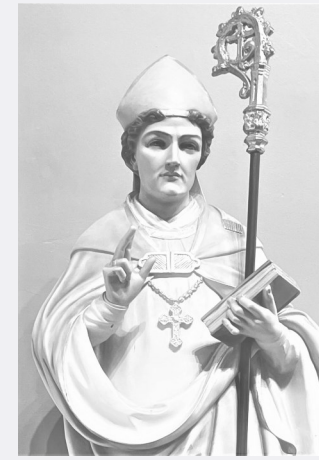
- Saint Stanislaw -