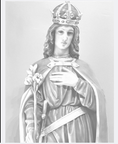
- Saint Kazimierz -

April 18th & 19th, 2026 Third Sunday of Easter