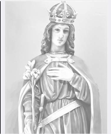
- Saint Kazimierz -