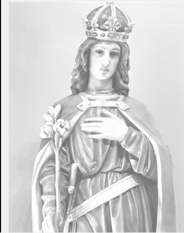
- Saint Kazimierz -

June 20th & 21st, 2026 The Twelfth Sunday in Ordinary Time