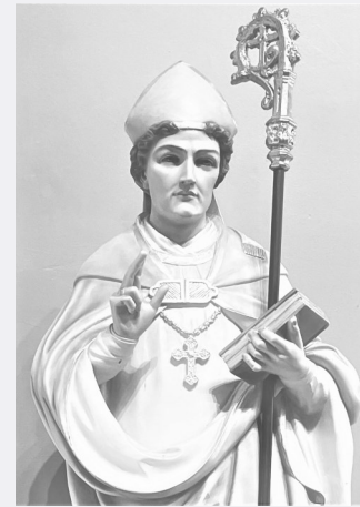
- Saint Stanislaw -

We will not be selling tickets during Holy Week or Easter week-end. If you need additional tickets please contact Doris or Virginia. The tickets are $1.00 each and our goal is to raise enough money to purchase a new Funeral Pall.