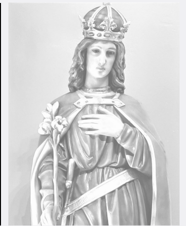
- Saint Kazimierz -

May 3rd & 4th, 2025 Third Sunday of Easter