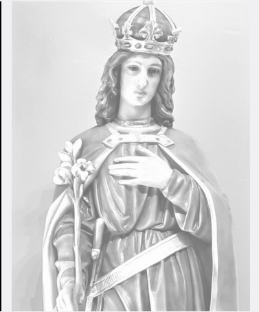
- Saint Kazimierz -

April 5th & 6th, 2025 Fifth Sunday in Lent